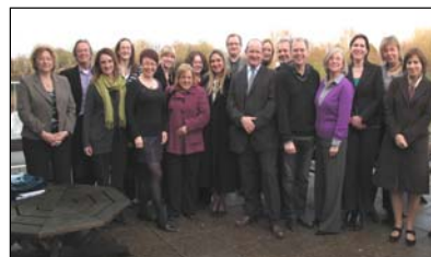
The Taskgroup members during the 1 st project meeting in Cardiff, Wales, 4-6 January 2010