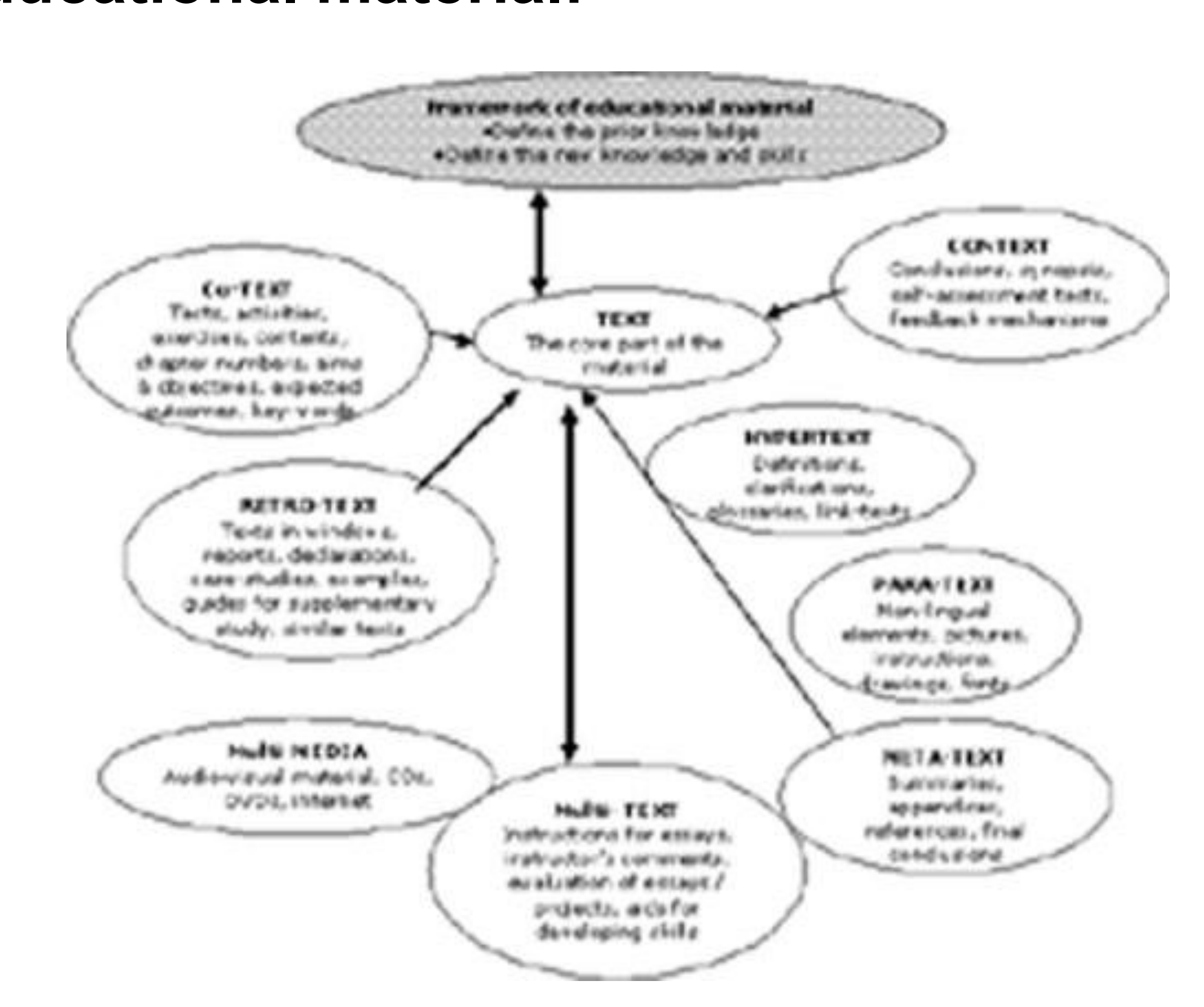
Figure 1. Methodological framework of educational material for adult distance learning

> The design of the e-page enabled the visual-perceptive learning of the reader. design principles (clarity, The standardization, simplicity, regularity, grouping, sense of direction, lists and tables, highlighting) were followed. The design pedagogical the e-module of constructive knowledge: the aims and objectives of the course and the expected written, outcomes were explanatory images and videos were provided, as well as self-assessment tests with feedback.